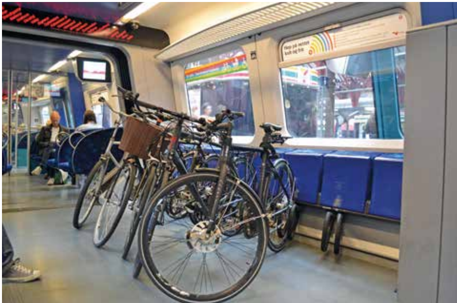
Figure 3.3.4 – Bicycle Stands in the Tram, Copenhagen.

the majority despite living in democracies with presumably similar rights of citizenship. The concept draws attention to the role of culture and social norms in securing leadership and the resilience of particular governance solutions. It also highlights how strategic use of science or cultural framing can dress up particular political positions. Gramsci's work draws heavily on that of Machiavelli, namely The Prince . For successful leadership towards the founding of a