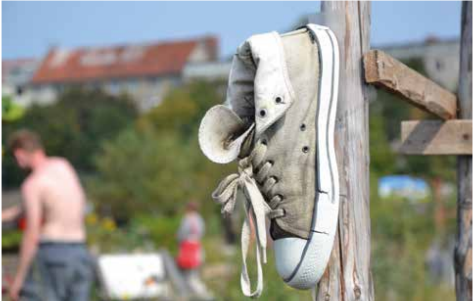
Figure 3.3.8 – Shoe bed at Allmende-Kontor Community Garden.

Applying futures literacy like the examples of practice reviewed in the previous section allows envisioning and creation of institutions, processes, technologies and business models that are sustainable by design rather than relying on cleaning up after the event. It also empowers actors to identify and speak up against the co-optation of new ideas, frames and narratives into the old paradigm so that their transformative potential is contained.