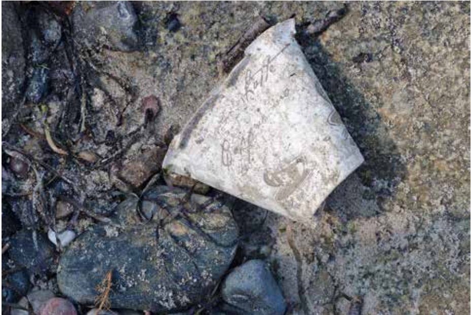
Figure 3.3.3 – Trash at the Beach.

What this paradigm therefore leaves unanswered is the core of the sustainable development vision: