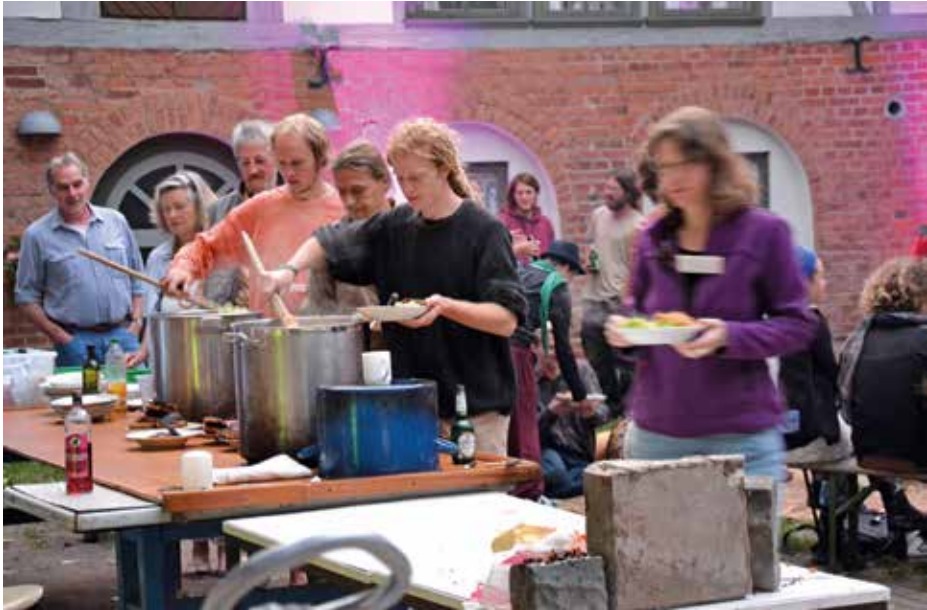
Figure 3.3.7 – Edible Cities Conference, Witzenhausen, 2013.

what earth and ancestors have provided, everyone is conceived to be a co-proprietor of the wealth created.