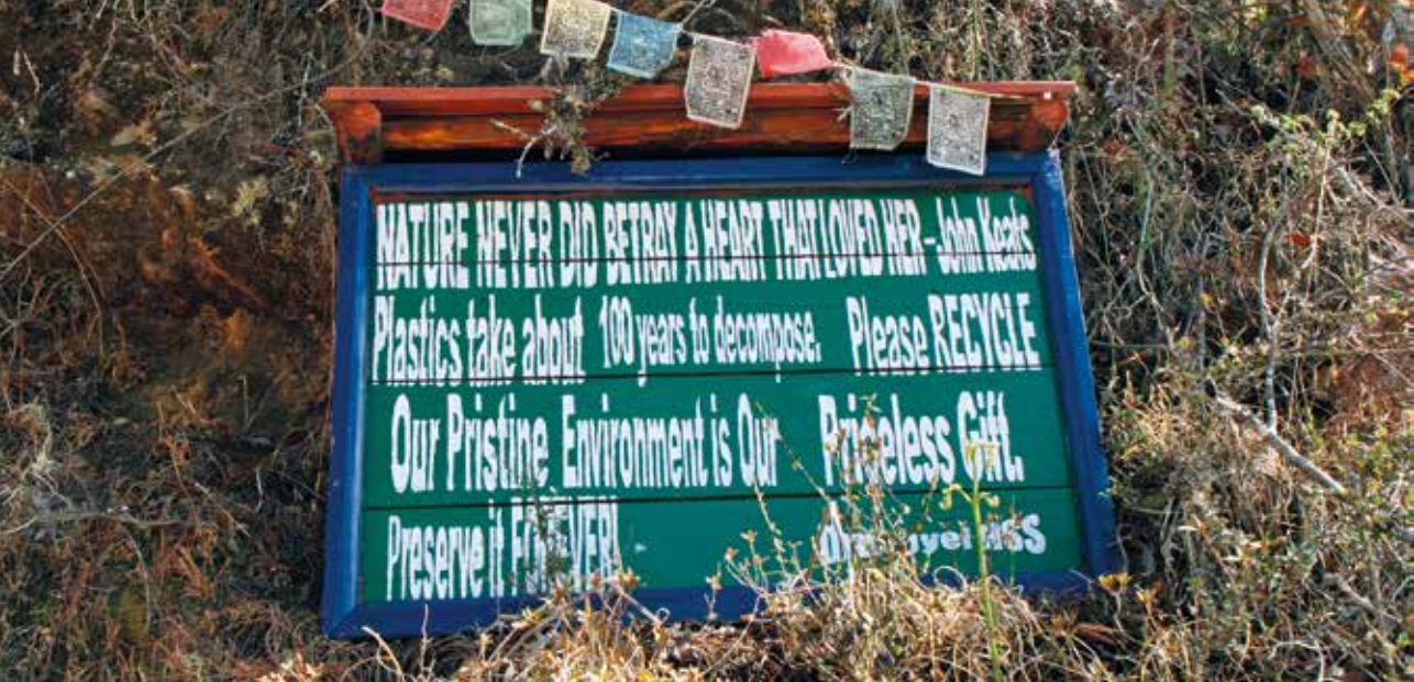
Figure 3.3.1 – Signpost in Buthan.

(any longer) in line with overarching goals and aspirations. Assessing the underlying assumptions and unstated ideas upon which social processes and institutions have been built, justified, maintained and adapted empowers us to break free from them if necessary. Reflexivity as an empowering and emancipating activity therefore forms a core of strategic engagement for changes to societal structures and institutions that have been set up and form ‘reality’ today. The World Social Sciences report 2013 coined the term ‘futures literacy’ when discussing leverage points for deeper and wider system changes for sustainable futures: