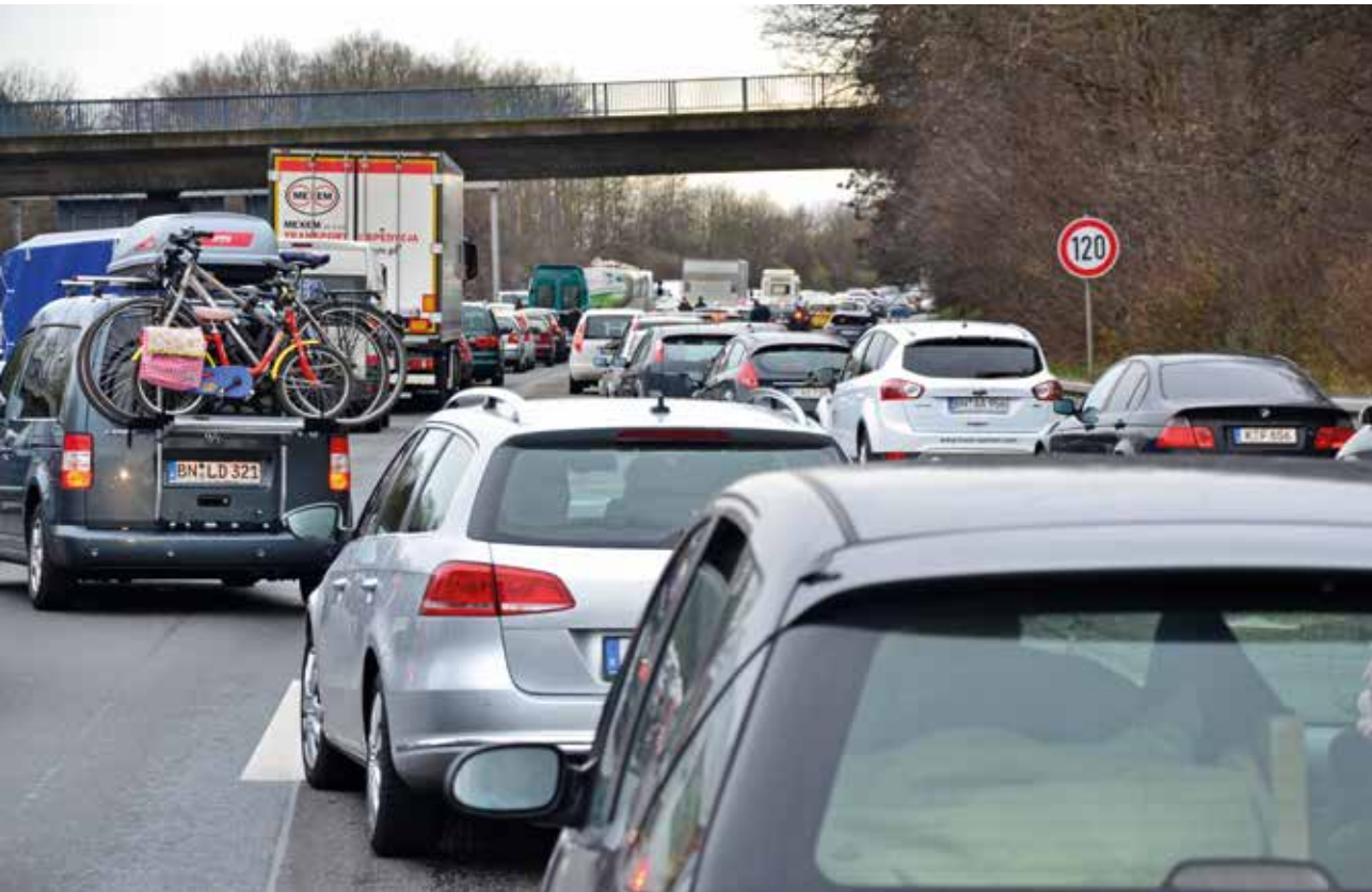
Figure 3.3.2 – Traffic Jam.

Each price therefore indicates 'willingness to pay' and provides a handy indicator of the utility created by a particular good or service: selfish people only pay as much as they really value something. Taken to the level of explaining entire economies and their development we find the origin of the third universal law, that of equilibrating competitive markets: every product finds a buyer once the price is right and human needs will therefore steer production in the right direction.